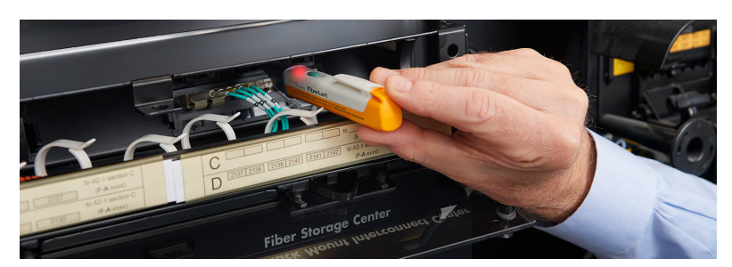
Determine if a port is live. Small size makes it easy to access cramped patch panels.