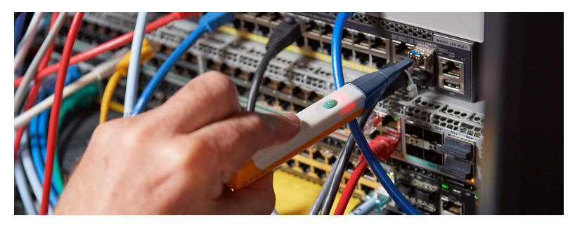
Determine if a transceiver is operational. FiberLert can detect fiber signals without making contact.

FiberLert™ Live Fiber Detector Page 2 of 5